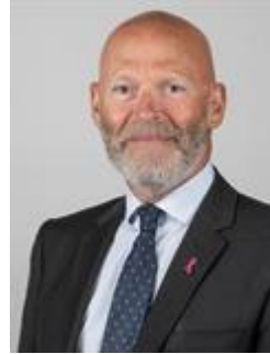
Senator Steve Pallett